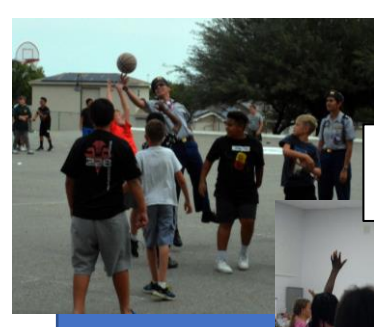
Cadets spend the day at Powell Elementary teaching students.